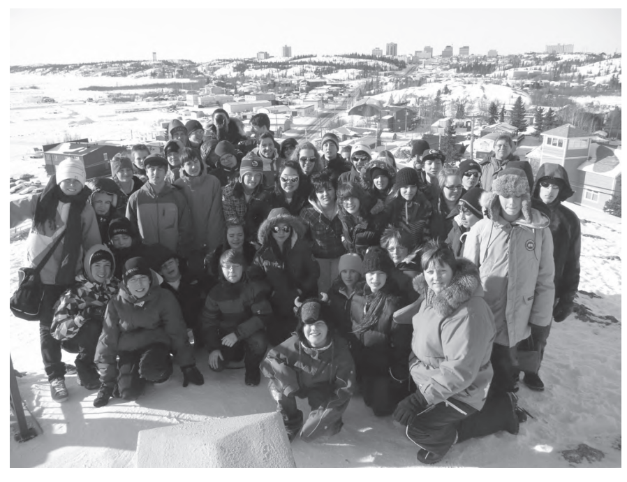
Students from Ecole Allain St. Cyr and College Saint-Charles Garnier from Quebec. They took part in a linguistic exchange on March 23-April 1st in Yellowknife. The Society for Educational Visits and Exchanges in Canada (SEVEC) provides young Canadians, between the ages of 12-17 an opportunity to develop cultural awareness and experience the diversity of Canada's communities. For more information go to this website: www.sevec.ca