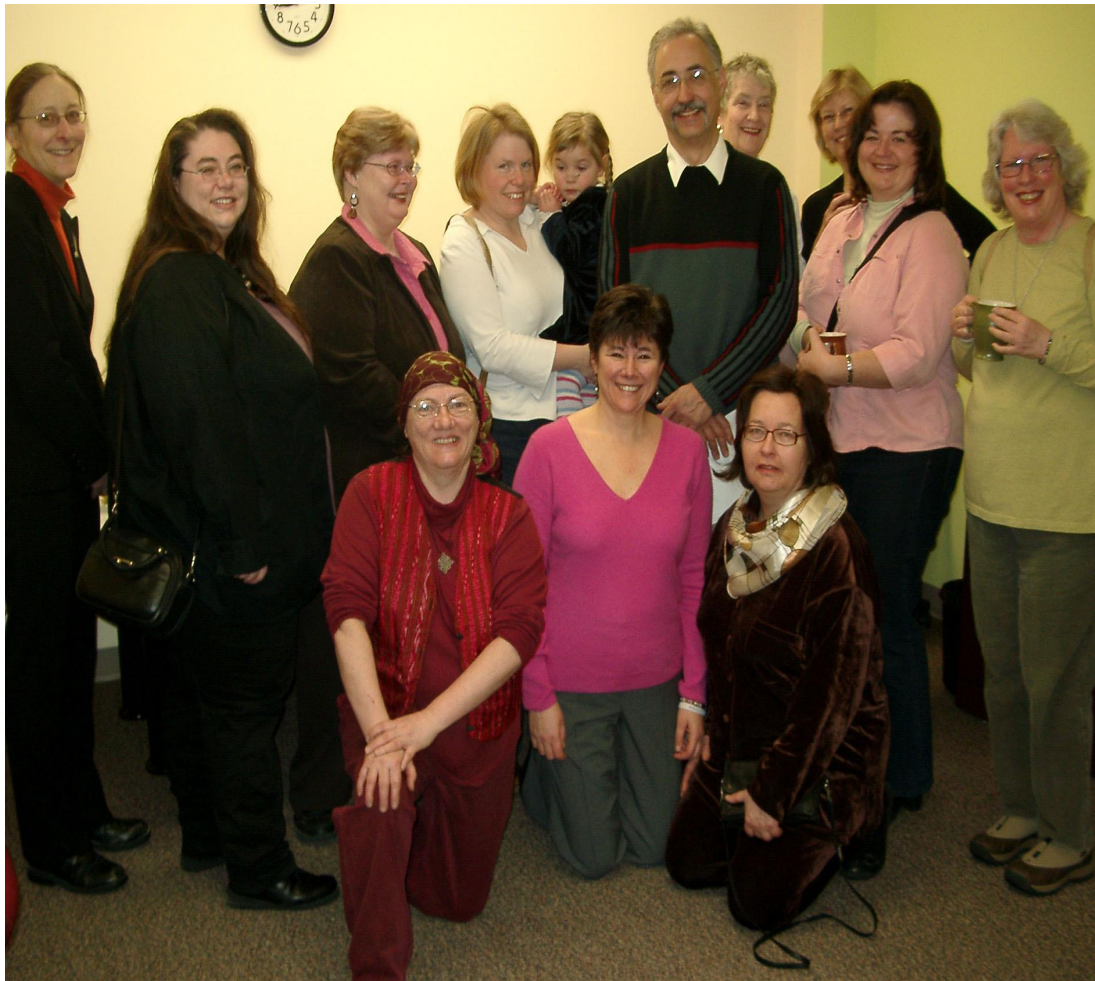
During International Women's Week Dennis hosted a breakfast to recognize the contributions women have made to the North.