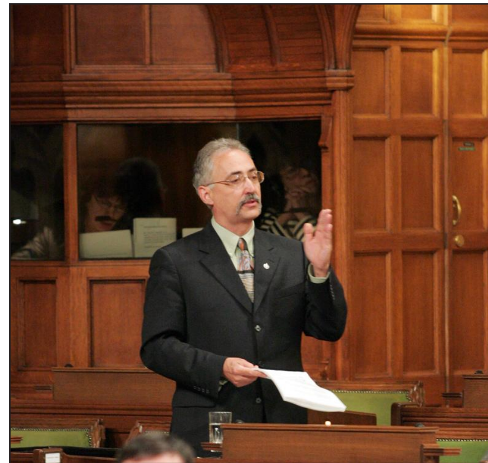
Dennis gives voice to Northern issues in the House of Commons

I ask the government to heed the voice of northerners and increase this deduction.